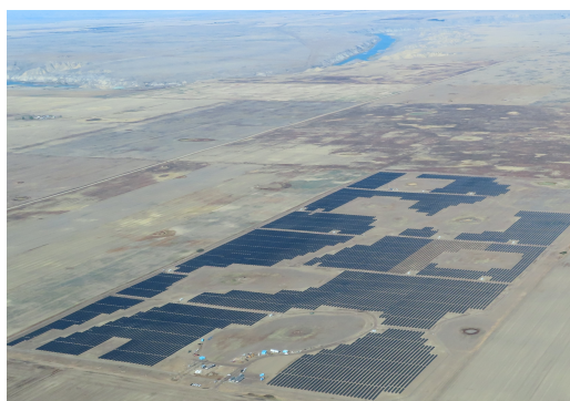
Empress solar project, Empress, Alberta, Canada

In September 2023, Canadian Utilities Limited, entered into a 12.5-year virtual power purchase agreement with Lafarge. Under the terms of the agreement, Lafarge's Exshaw cement plant will notionally purchase 100 per cent of the solar power generated from the 38.5-MW Empress solar project, meeting 34 per cent of the plant's power requirements through 2036. The Empress solar project achieved energization in the third quarter of 2023 and full commercial operations is expected to commence in the fourth quarter of 2023.